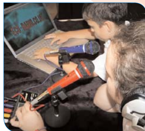
Recording of eco news.