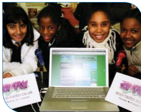
Local children launch eco radio station.